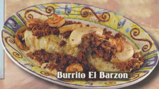
Burrito El Barzon

Big steak and onion burrito topped with melted cheese and order of rice.