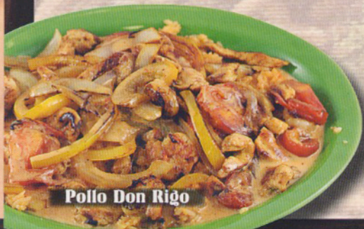
Pollo Don Rigo